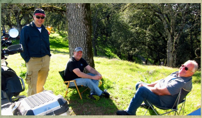
ulla Illusellas nec mount. Acuran behicula, hirpis in conque chilend. at.