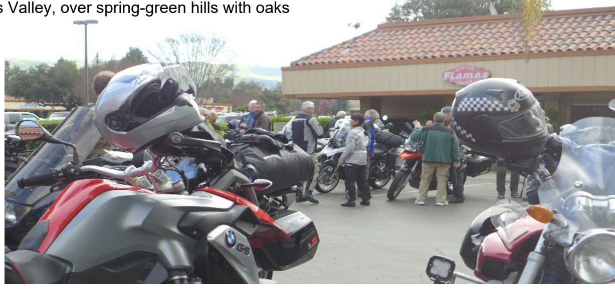
BMW Motorcycle Club of Northern California 7